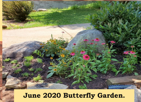
June 2020 Butterfly Garden.