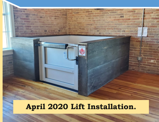
April 2020 Lift Installation.

2020 Has been a challenging year for everyone. Despite these challenges, the Swannanoa Valley Museum continues to thrive and grow. This would not be possible without the support and love we have received from our community. We can say with pride that we have ended our fiscal year in the black. This is the 31st year that we have accomplished this. Our other successes have been the installation of the lift to our second floor gallery. This lift allows all of visitors to visit the "Our Pathways" Exhibit. We were able to install a beautiful butterfly garden behind the museum. This garden furthers our mission to educate the public about not only the history Of the Swannanoa Valley but its ecology as well. This garden was made possible by a generous sponsorship from the Black Mountain Savings Bank.