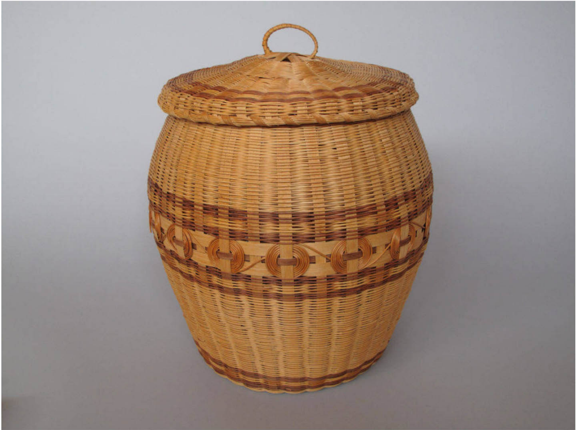
Lidded storage basket by Lucy George. Honeysuckle woven over white oak ribs. Walnut dye for brown colored ribs, bloodroot for orange, and yellowroot for bright yellow.