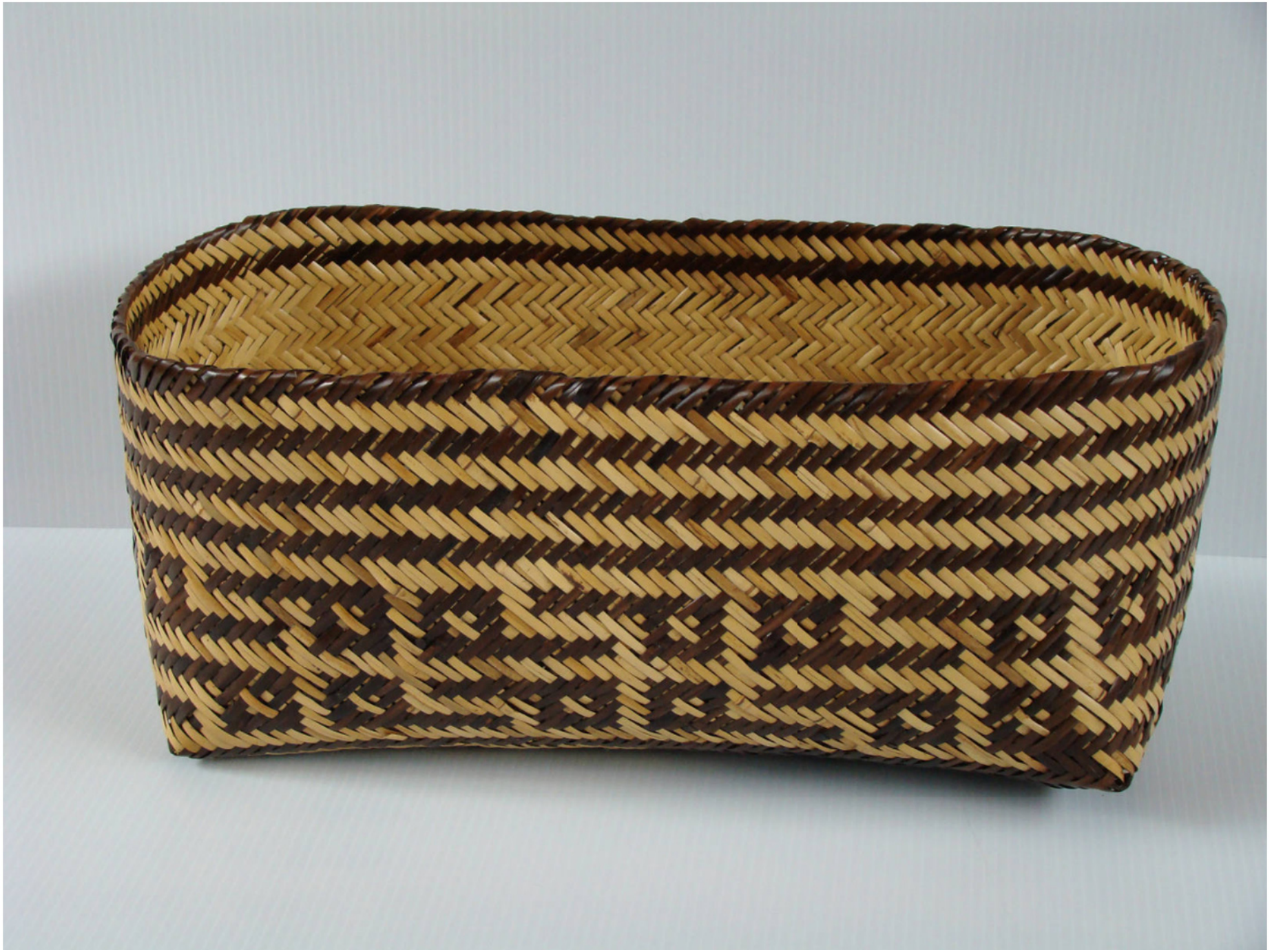
Storage basket using Peace Pipe design by Lottie Queen Stamper. Rivercane with black walnut dye.