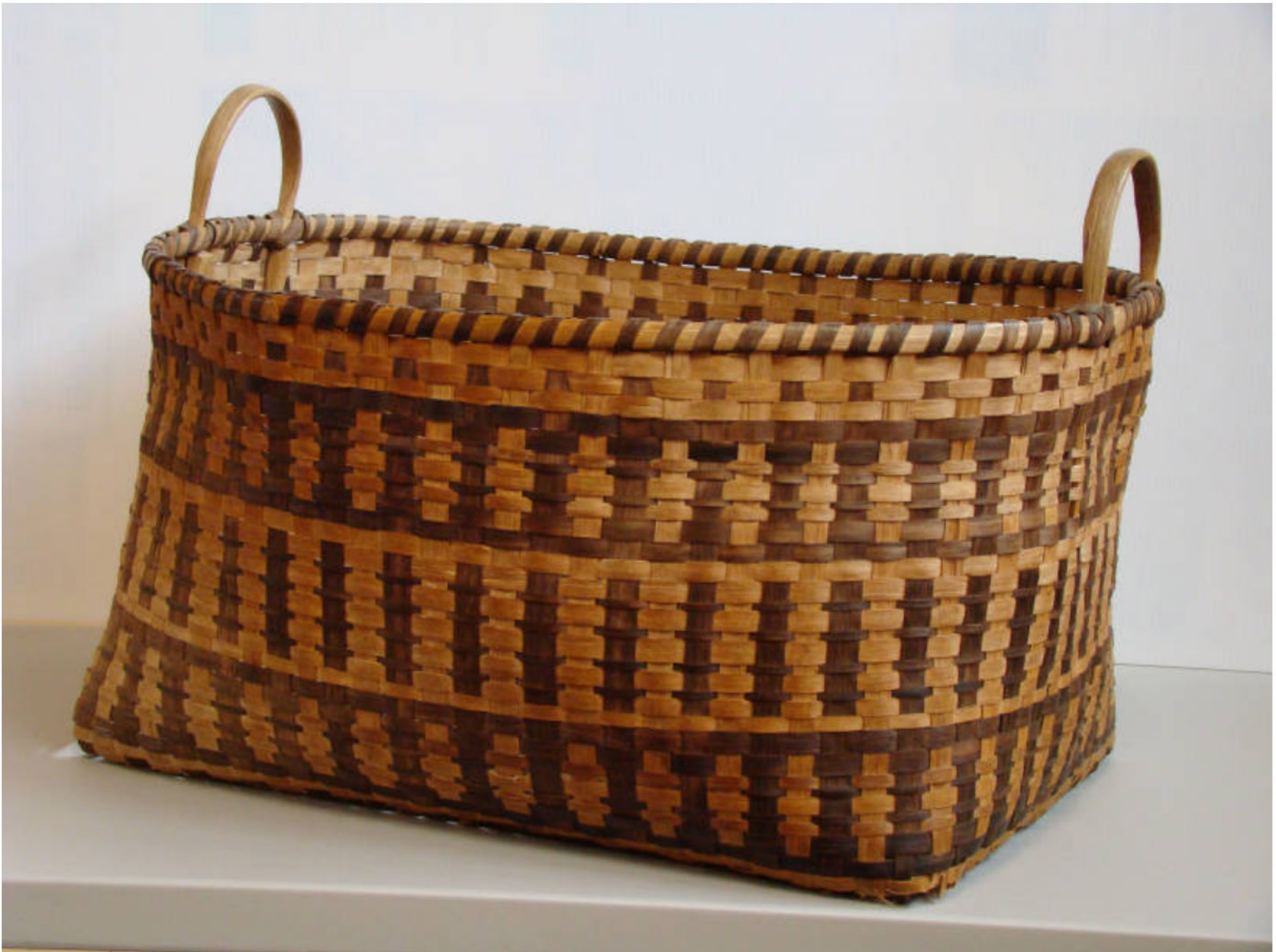
Storage or laundry basket by unknown Cherokee artist. White oak.