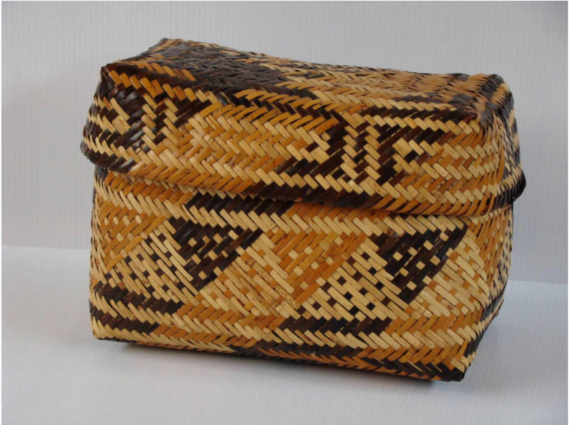
Lidded storage basket by Carol Welch. Rivercane, with butternut for dark brown dye and bloodroot for orange dye.