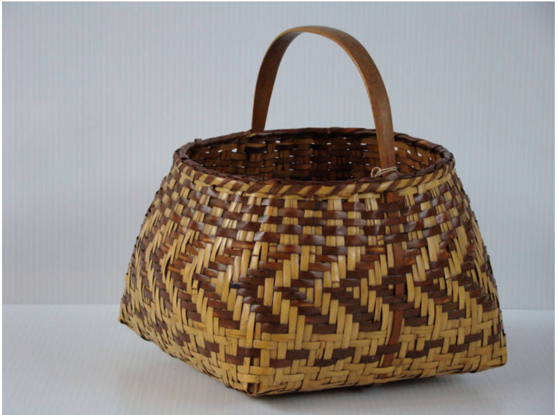
Egg basket using fishbone or, arrow point pattern by Annie Ropetwister. Rivercane with butternut dye.